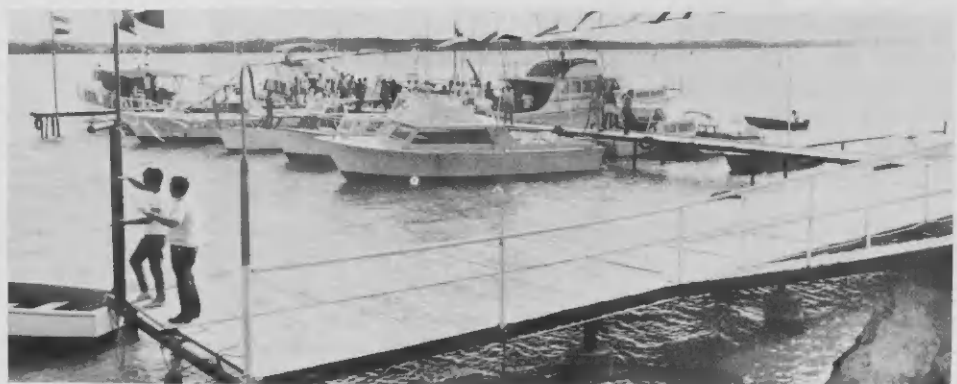
Some of the 21 boats which participated in BYCA's 1st International Fishing Tournament.